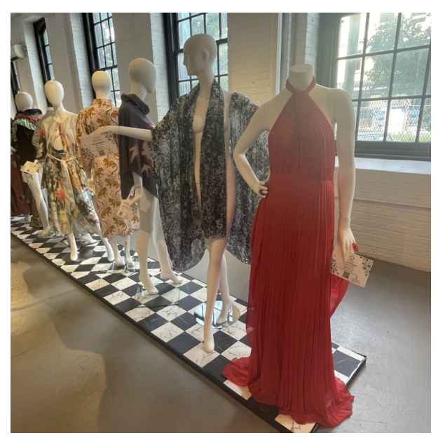
ILLUME exhibit garments

Once we finally got in, the gallery attendant led us to the check-in desk where we were given pamphlets about the details of the displayed garments and the designers that created them. To start the exhibition, there was a visual timeline (pictured above) highlighting organizational high points. Nearby, there was a comprehensive display containing photos and snippets of news stories. Both of these gave a sense that PFI has been doing the work for years to build up the fashion industry in Philadelphia (which they have).