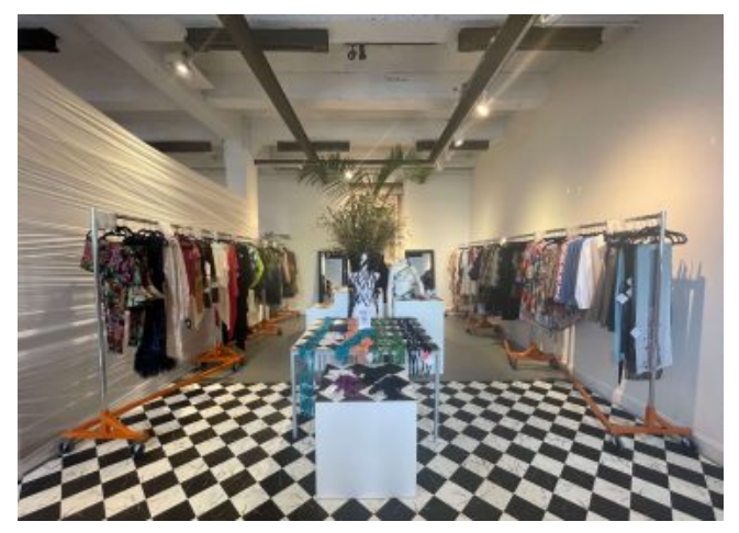
ILLUME exhibit, designer retail section; © Manic Metallic 2021

The Illume fashion exhibition, centered around the <u>Philadelphia Fashion Incubator (PFI)</u>, is currently being hosted at the <u>InLiquid Gallery</u> in Philadelphia, PA. The exhibit is broken into two portions: the primary portion is a retrospective on the work of previous Philadelphia Fashion Incubator participants over the past decade, with the second portion (pictured above) being a retail area where the public is welcome to purchase designs from both former and current PFI participants.