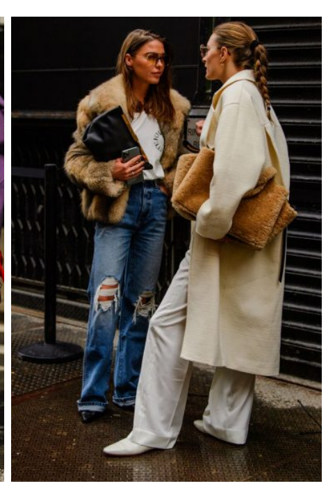
Photos taken during New York Fashion Week F/W 2020

There is a clear bias that is had toward the two women in this example, and the bias swings strongly in favor of the woman starting a tech business. She is seen as intelligent, ground-breaking, and using her mind to take on the patriarchy. Woman #2... I feel bad for her. She's seen as a number of things – all of them a different shade of sexist: