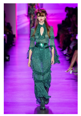
Anna Sui F/W 2020

We need to have a discussion about fashion. Specifically, we need to discuss why it is that women that have a love for fashion are not taken as seriously as women that do not show an outward interest in this liability of a subject (hint: fashion is not actually a liability; that's just what certain elements of society would have you believe).