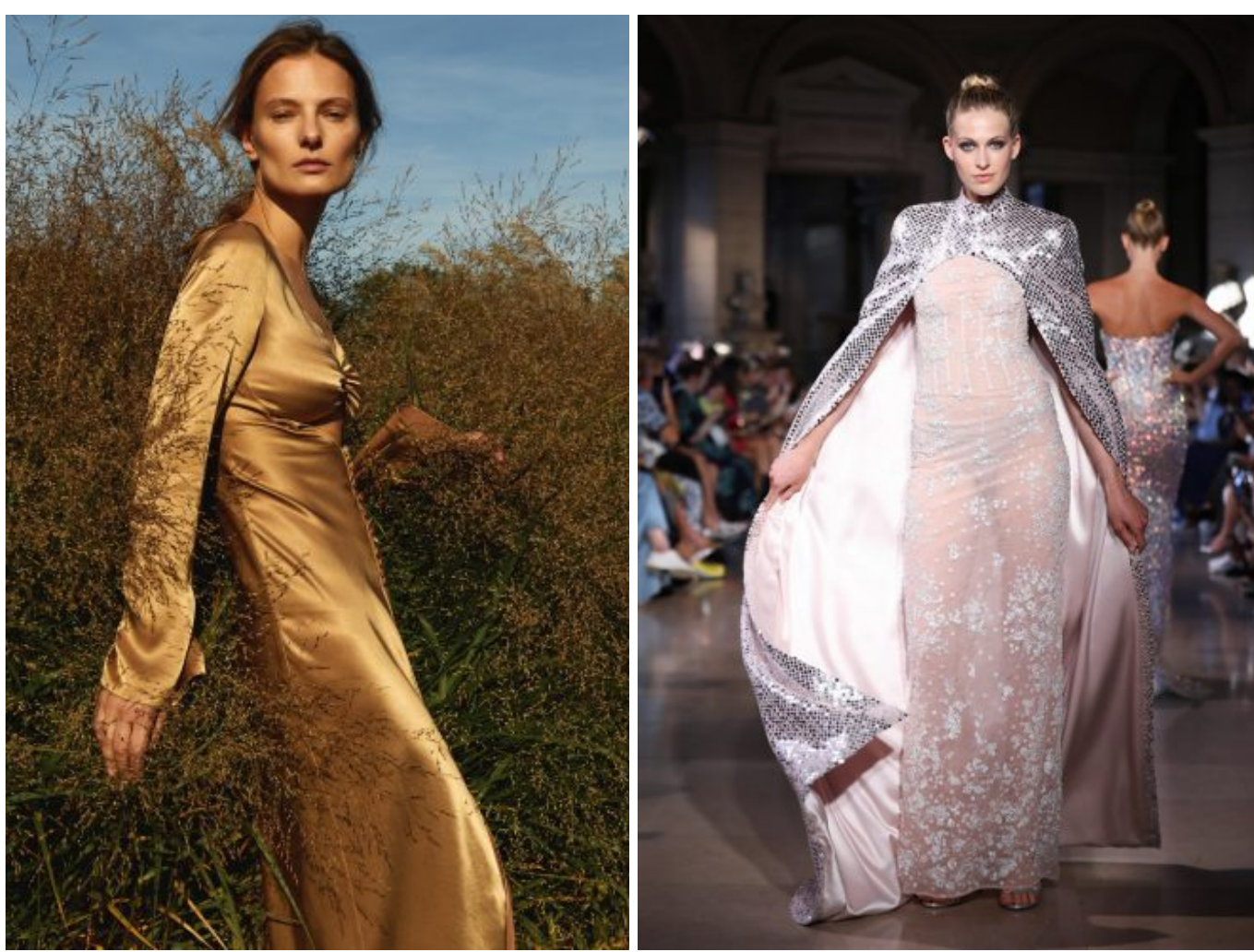
Anna October S/S 2020; Rami Kadi F/W 2020 Haute Couture

One thing that I'd like to make clear – it is okay if a woman does not actually like fashion. Not all women are the same. What is not okay, however, is when women that are devoted to a subject traditionally seen as a 'woman's subject' are shamed by members of both sexes. What I call that is a failure of feminism. Feminists should be working to protect the rights of ALL women to achieve their full potential in life – no matter what that potential may involve. I say to you, then, to take this message forward into your daily life and wear what you'd like. Chase whatever career excites you. And, know that you are as intelligent as any person that builds tech companies, designs structures, or runs countries.