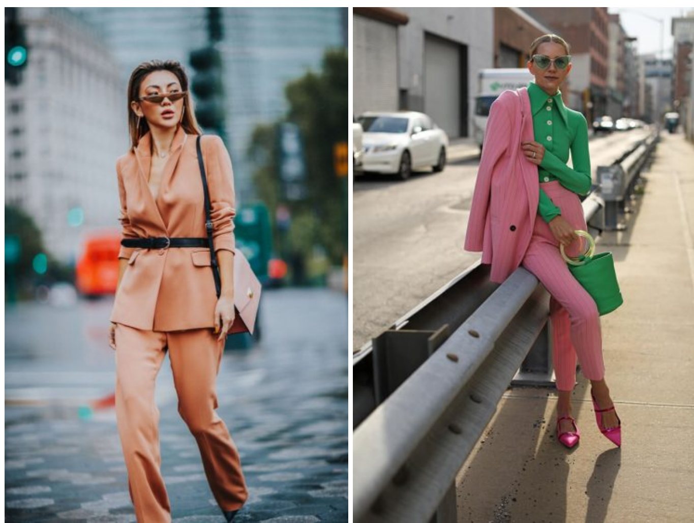
Professional women can love both fashion and work

Now, if a woman comes along that is not willing to abide by society's mores that state strange things like 'Smart women don't busy themselves with fashion', those 'success-by-any-means-necessary' women are appalled. They believe that women that genuinely love fashion are setting the feminist movement back 100 years. These fashion-loving women become a perceived threat to the position of all women that have worked so hard to be taken seriously by men over the years.